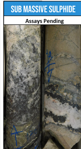
Figure 1: Photos of massive sulphide mineralization from the Napoleon and Josephine veins