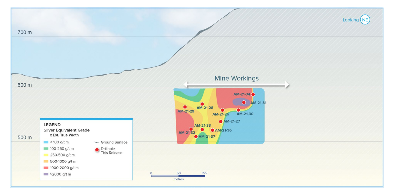
Figure 2: Rosarito Zone Contour Longitudinal Section

The Company believes the northern end of the Animas Vein Corridor has significant potential to host additional resources and will continue to explore this area throughout 2022. Additionally, the Company is reviewing the potential to utilize existing workings in the area to conduct underground drilling. This may provide improved access to drill more vein intercepts in less time at lower overall costs.